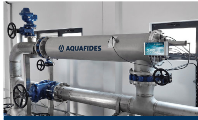
OptiLon 8AF640A for wastewater treatment

Static and dynamic lamp dimming with UV dose control ensures maximum efficiency and energy savings. Permanent dimming is made possible by state of the art UV lamp technology which uses intelligent heating so lamps always operate in the optimal operating window (also in very cold water). This also has a positive effect on the lamp lifetime.