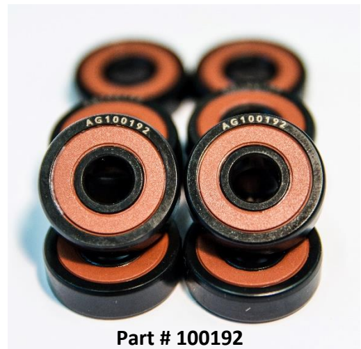
Part # 100192