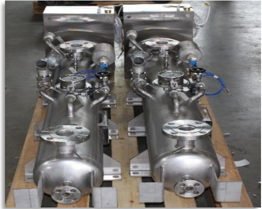
Vertical brake resistors delivered to Transocean.