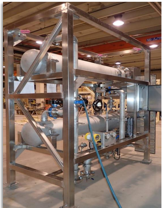
Brake resistors delivered to NOV 2 x 2 x 368 kW 3ph. ATEX and DnV