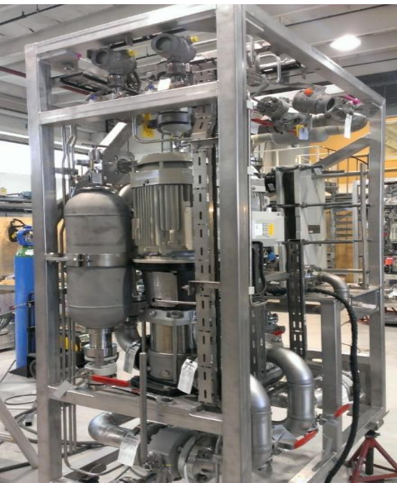
120 KW Sea Water Cooling system delivered to BP Clair Rigde. Approved to BP and Lloyd's specifications. ATEX.