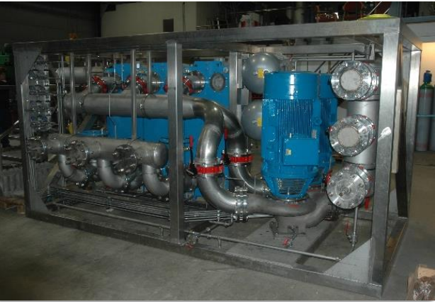
Seawater/freshwater buffersystem with leakage detection and automatic emergency filling. Three units delivered to Odfjell