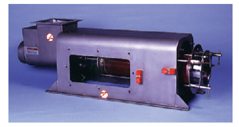
722 Centrifugal Sifter