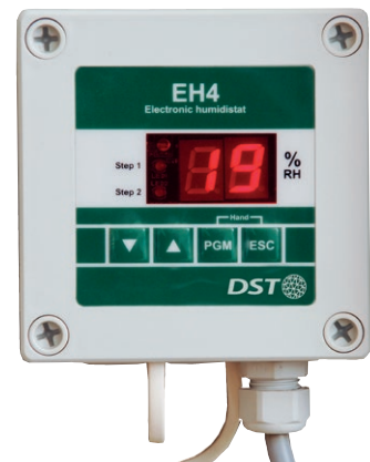
EH4 and standard room sensor IP65. Room sensor: low voltage 3 m. Optional: 25 meters RJ9 extension cable (50 meters maximum)

Option: External display. Display and key set via a 25 m low voltage cable